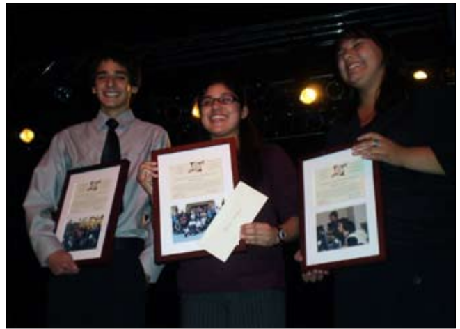
Proudly serving the San Diego American Indian Community for 16 years